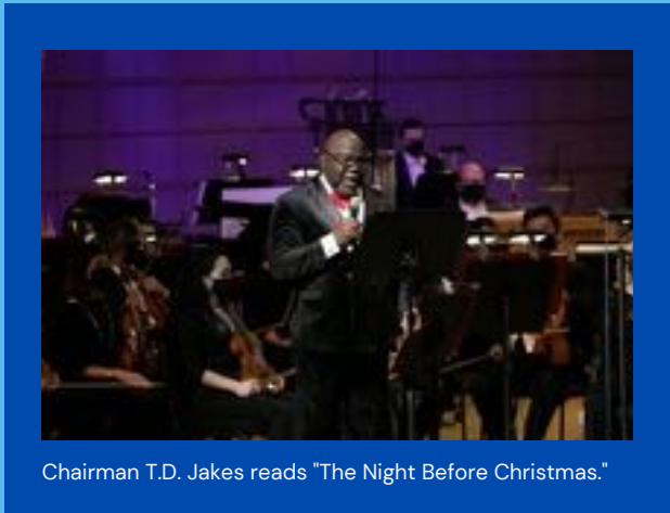
Chairman T.D. Jakes reads "The Night Before Christmas."