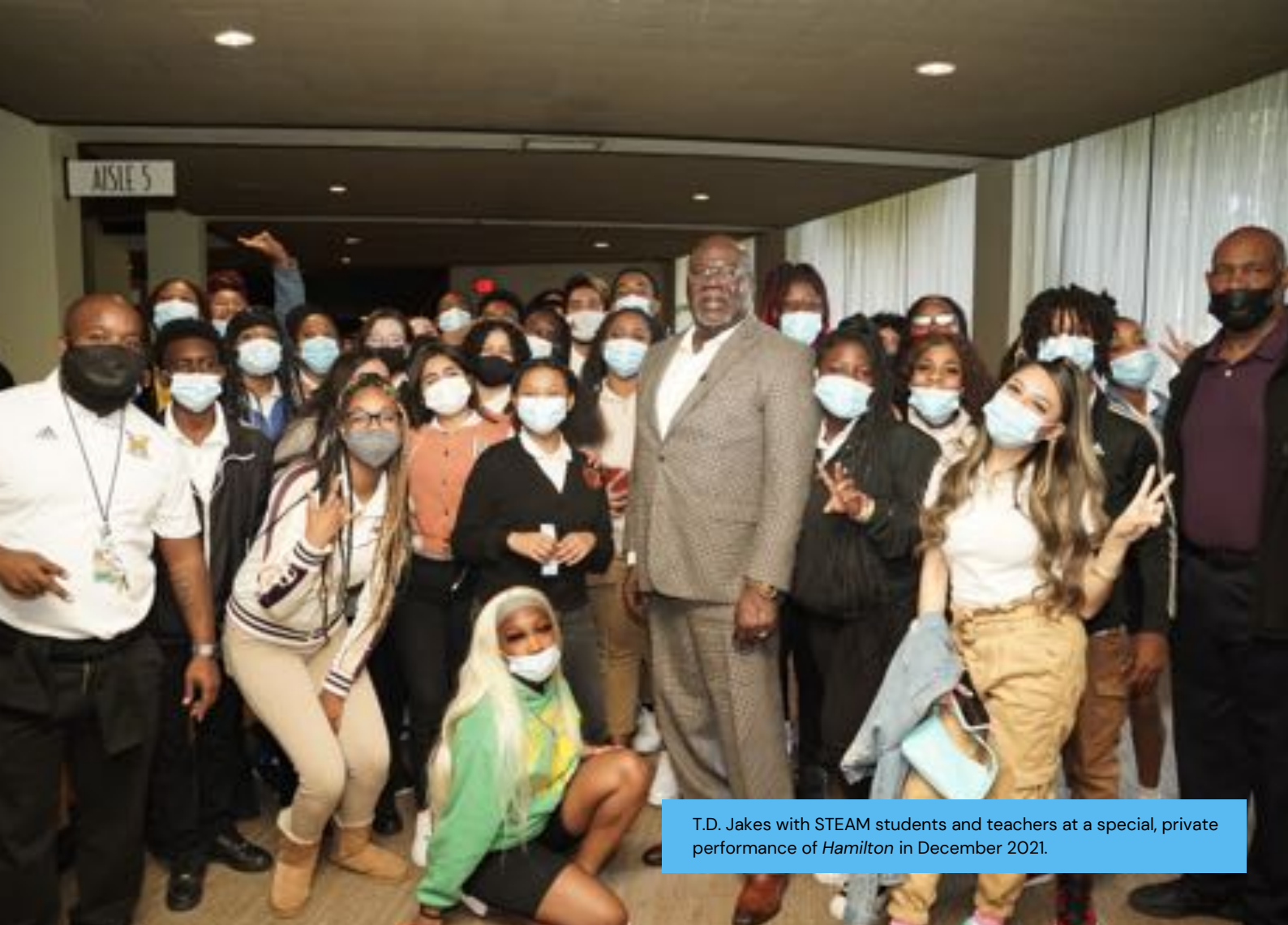
T.D. Jakes with STEAM students and teachers at a special, private performance of Hamilton in December 2021.