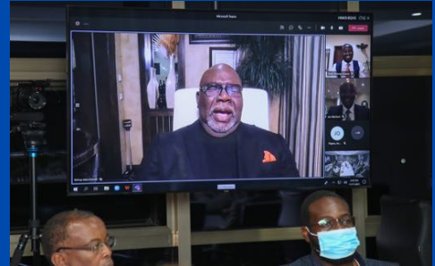
Chairman T.D. Jakes virtually addresses the team in Kenya.