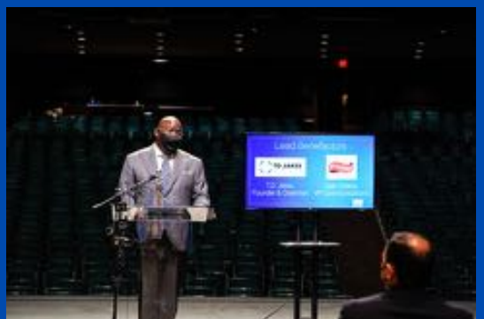
Chairman T.D. Jakes announcing the Foundation's Hamilton STEAM partnership in October 2021.