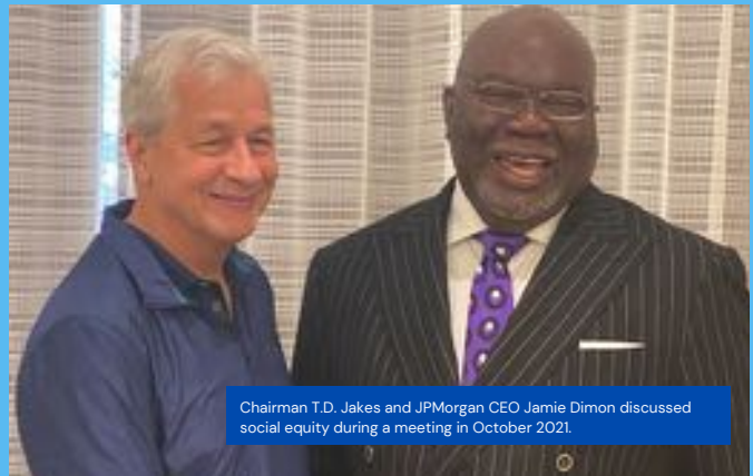
Chairman T.D. Jakes and JPMorgan CEO Jamie Dimon discussed social equity during a meeting in October 2021.

Conscious Capitalism provides executives with innovative and inspiring experiences designed to level up their business operations and collectively demonstrate how capitalism can be used as a force for good when practiced consciously.